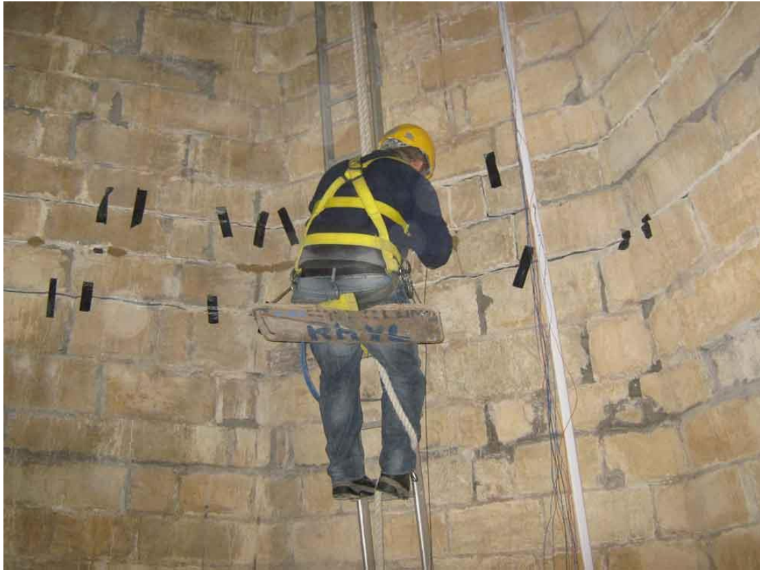
Figure 7 Anode ribbon being installed internally either side of the ring beams using rope access, St Aldhelms church, Doulting.