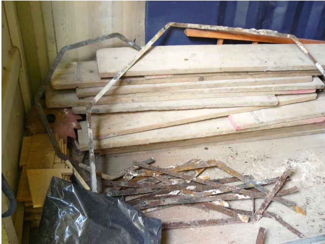
Figure 3 Corroding wrought iron fittings, which were readily removed from the tower, St Mary's church, Balderstone.