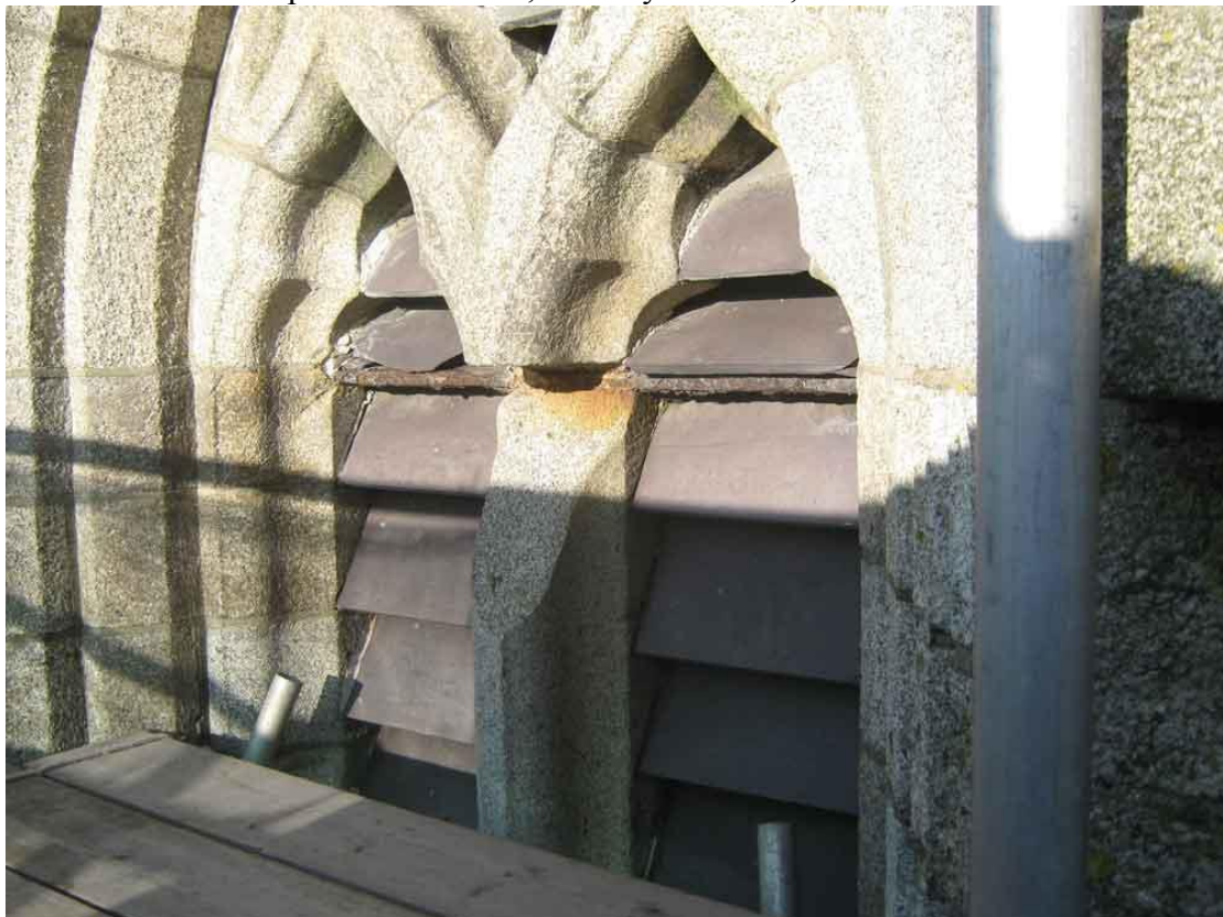
Figure 2 Large tie bars embedded in the inner masonry and passing through the mullions, resulting in fracture of the granite, St Aidan's Cathedral, Enniscorthy.