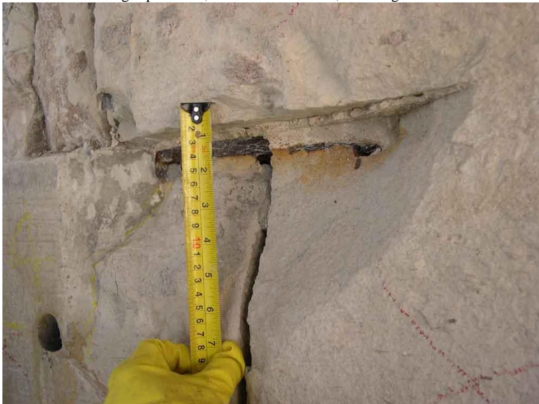
Figure 8 Internal damage to the stones due to corrosion of an iron cramp, St Michael and All Angel's church, Great Witley.