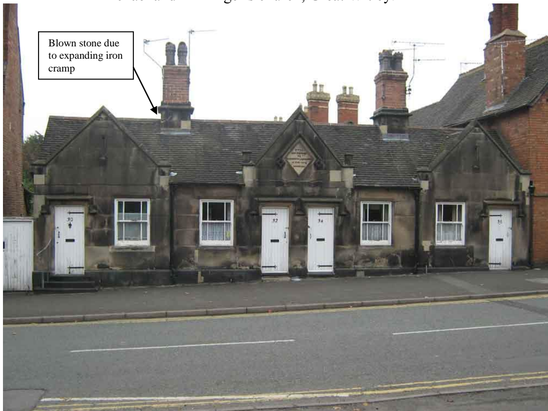
Figure 10 Whitchurch Almshouses ten years after the installation of cathodic protection – showing an unprotected cramp on the chimney has now fractured the stone.