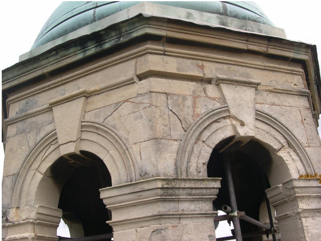
Figure 9 External damage to the tower due to corrosion of iron cramps, St Michael and All Angel's church, Great Witley.