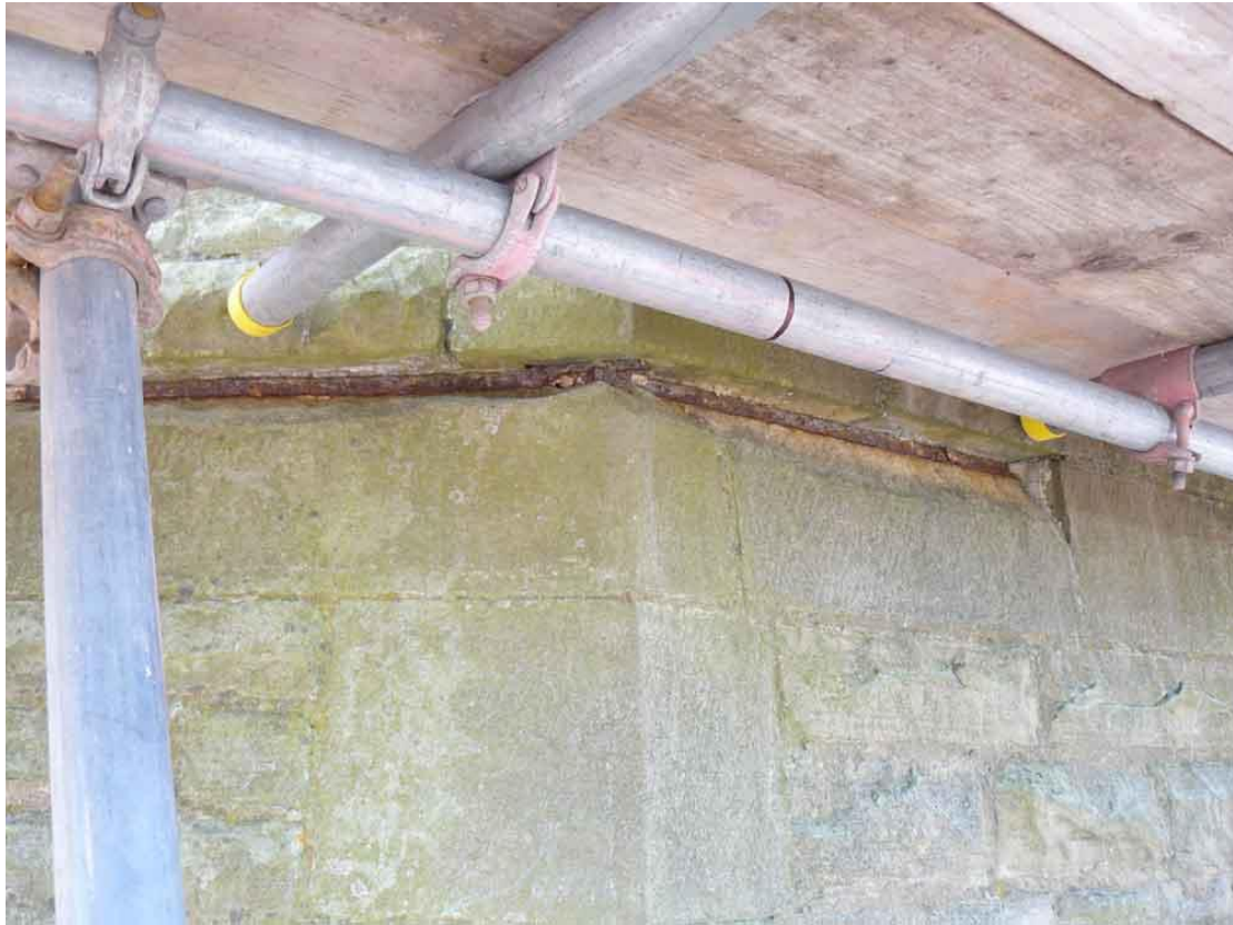
Figure 1 Tie bars embedded in the outer masonry and judged to be too disruptive to remove, St Mary's church, Balderstone.