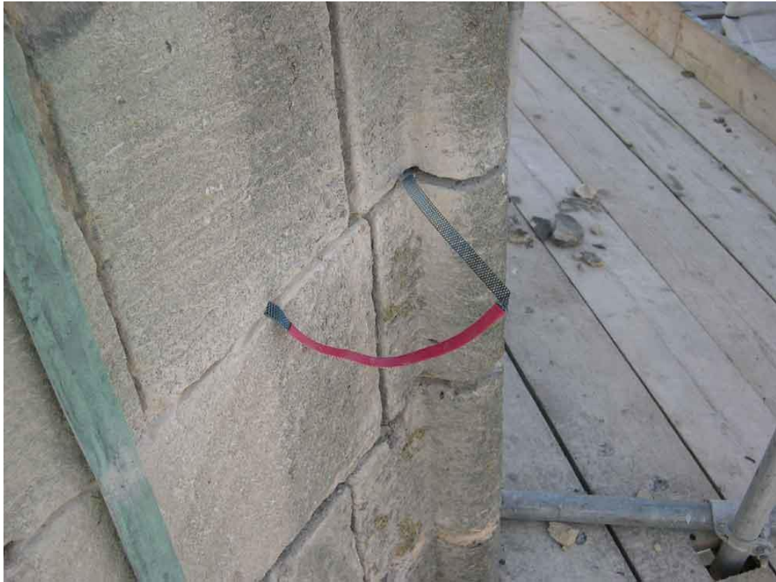
Figure 5 Anode ribbon being installed externally above and below the wrought iron to provide cathodic protection, St Mary's church, Kiddlington.